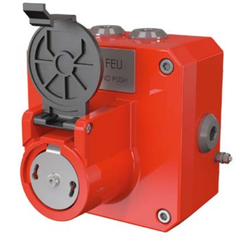
GNExCP7-PT / GNExCP7-PM