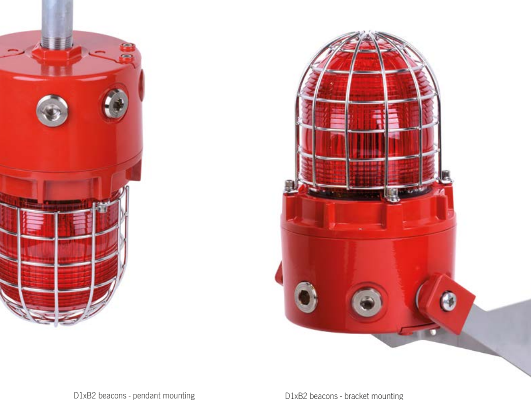
D1xB2 beacons - bracket mounting allows beacon to be rotated in any orientation

The globally approved D1xB2 family from E2S offer the most comprehensive range of solutions for UL1638 signaling in Class I/II Div 1 or Zone 1/20 explosion proof applications..