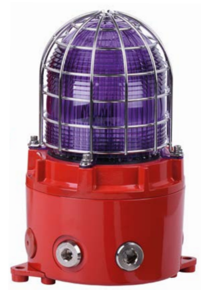
D1xB2 beacons- surface mounting